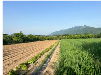
Guided tour: Azienda Agricola Rusciano