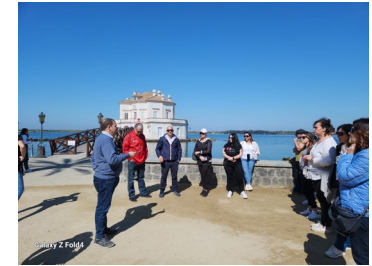
Guided tour: CIC Centro Ittico Campano